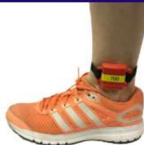
Number facing outwards